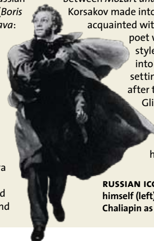
RUSSIAN ICONS: Alexander Pushkin himself (left); a portrait of bass Feodor Chaliapin as Boris Godunov (above)

he wrote a dramatic scene concerning the relationship between Mozart and Salieri (which Rimsky-Korsakov made into an opera). He was also acquainted with Glinka, who hoped the poet would adapt his folklore-style epic Ruslan and Ludmila into a libretto for operatic setting: alas, only months after the historic premiere of Glinka's A Life for the Tsar , Pushkin was shot in a duel which he himself had called to defend his wife's honour.