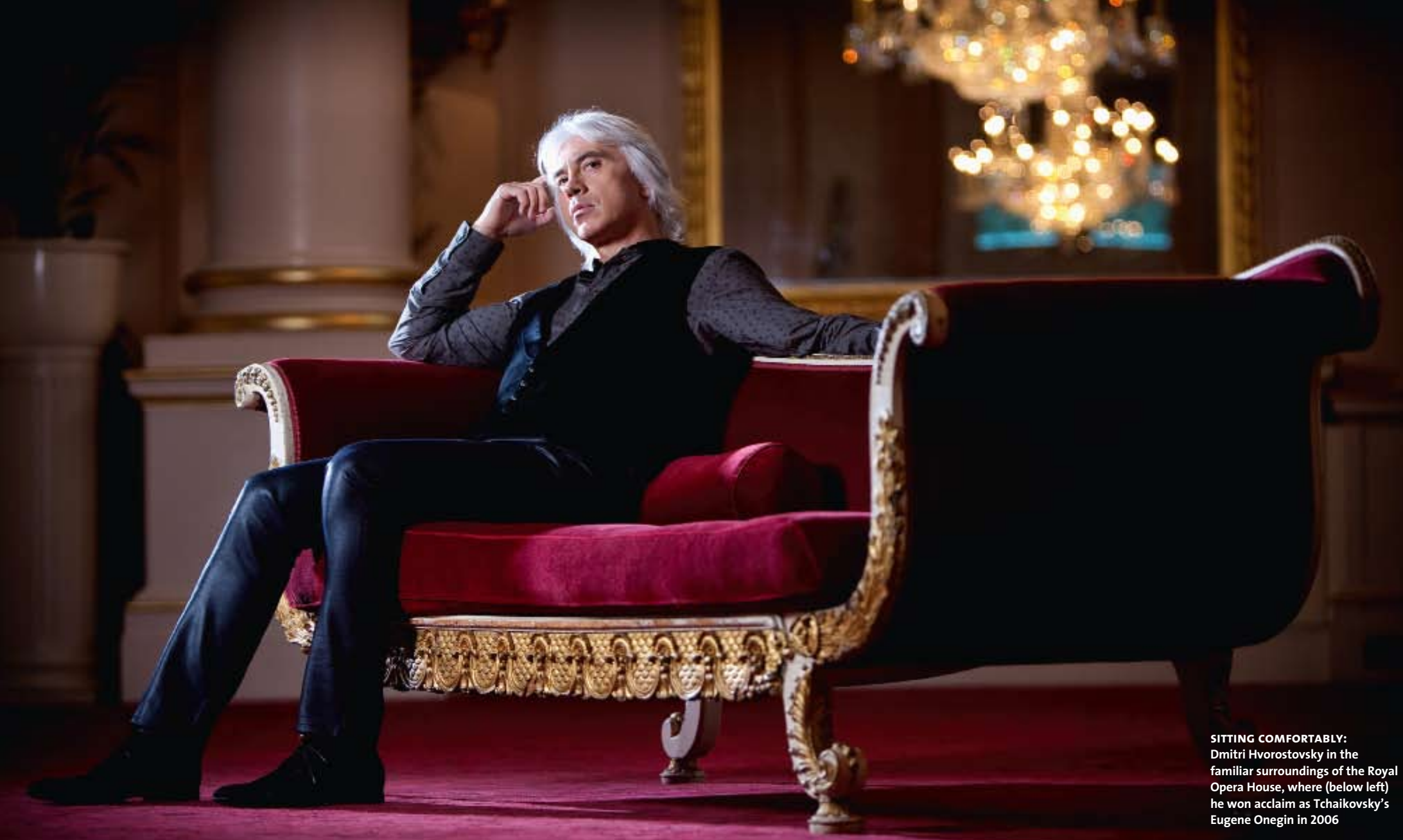
SITTING COMFORTABLY: Dmitri Hvorostovsky in the familiar surroundings of the Royal Opera House, where (below left) he won acclaim as Tchaikovsky's Eugene Onegin in 2006

NOW 47, HVOROSTOVSKY is in his vocal pomp, acclaimed as the definitive Eugene Onegin, Tchaikovsky's Byronic world-weary anti-hero, of his generation, yet also regarded as the world's leading interpreter of the lyric Verdi roles. In April he sang Giorgio Germont in Covent Garden's La traviata , and next season he returns in the title role of David McVicar's staging of Rigoletto .